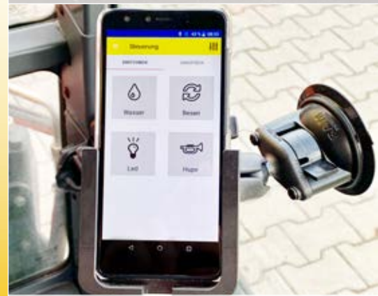
Startup screen of Smartphone control