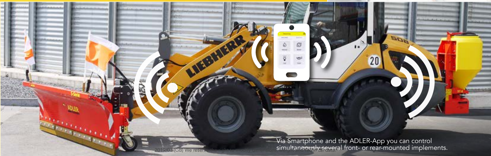
Via Smartphone and the ADLER-App you can control simultaneously several front- or rear-mounted implements.