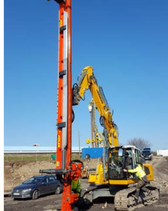
Easy control of all implements via Bluetooth, also possible for products of other manufacturers