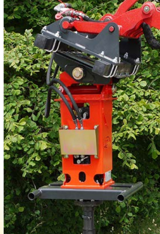
EG 500 Geared Auger

* Weight without mounting system ** For excavator with an operational weight from 10 t a leakage pipe will be indispensable