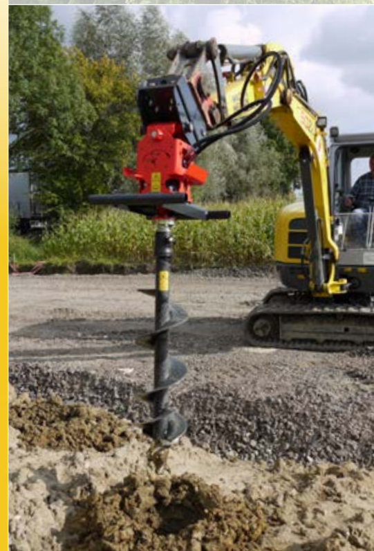
Auger on mini-excavator