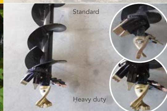
Auger drills and different qualities in standard and heavy-duty design