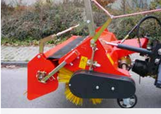
K 450 with mechanical hopper emptying