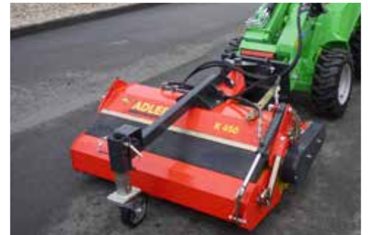
K 450 on multifunction loader