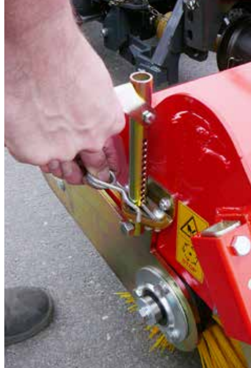
Brush adjustment via push-fit system