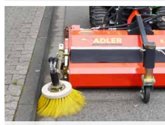
Rotary side bruh in use