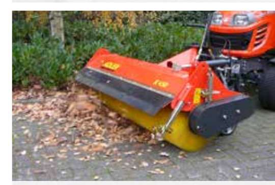
K 450 for simple sweeping