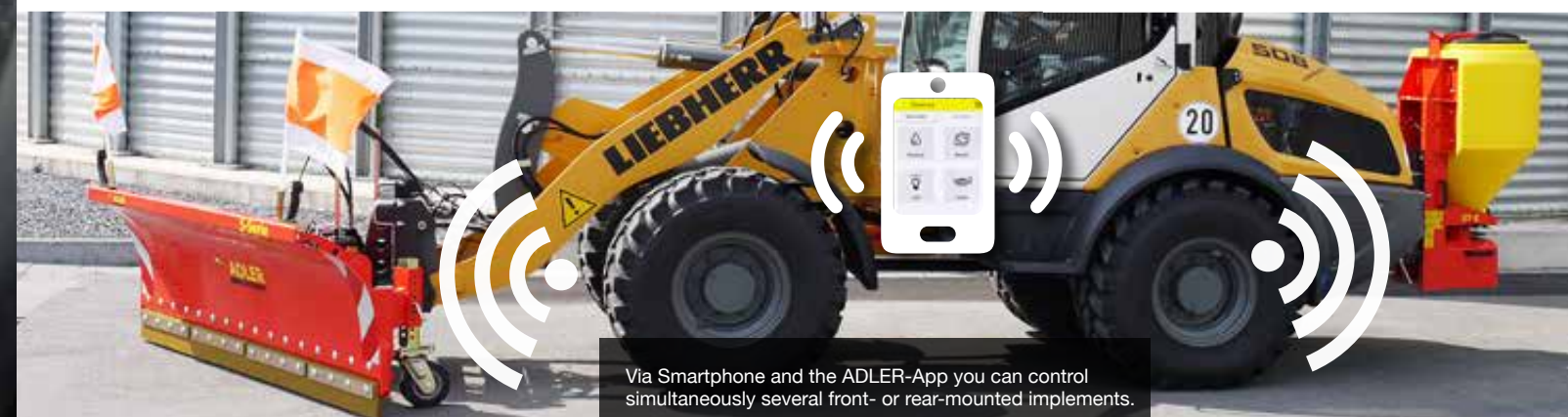
Via Smartphone and the ADLER-App you can control simultaneously several front- or rear-mounted implements.