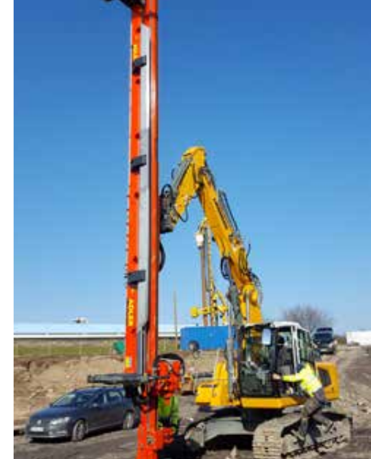
Easy control of all implements via Bluetooth, also possible for products of other manufacturers